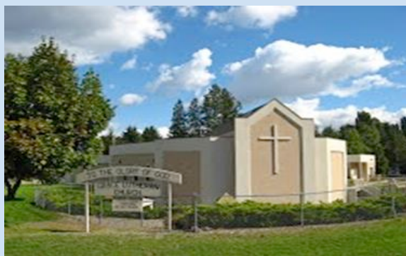
Celebrating our Annual General Convention for 2014

CALC is a Community of Independent Congregations Living Together